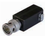
Video balun DS-1H18