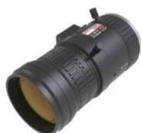
HV1140D-8MPIR 11 to 40 mm DC Iris