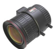
HV3816P-8MPIR 3.8 to 16 mm P-iris