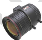
HV3816D-8MPIR 3.8 to 16 mm DC Iris