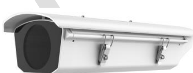
DS-1331HZ-C/H/W/HW Outdoor Housing