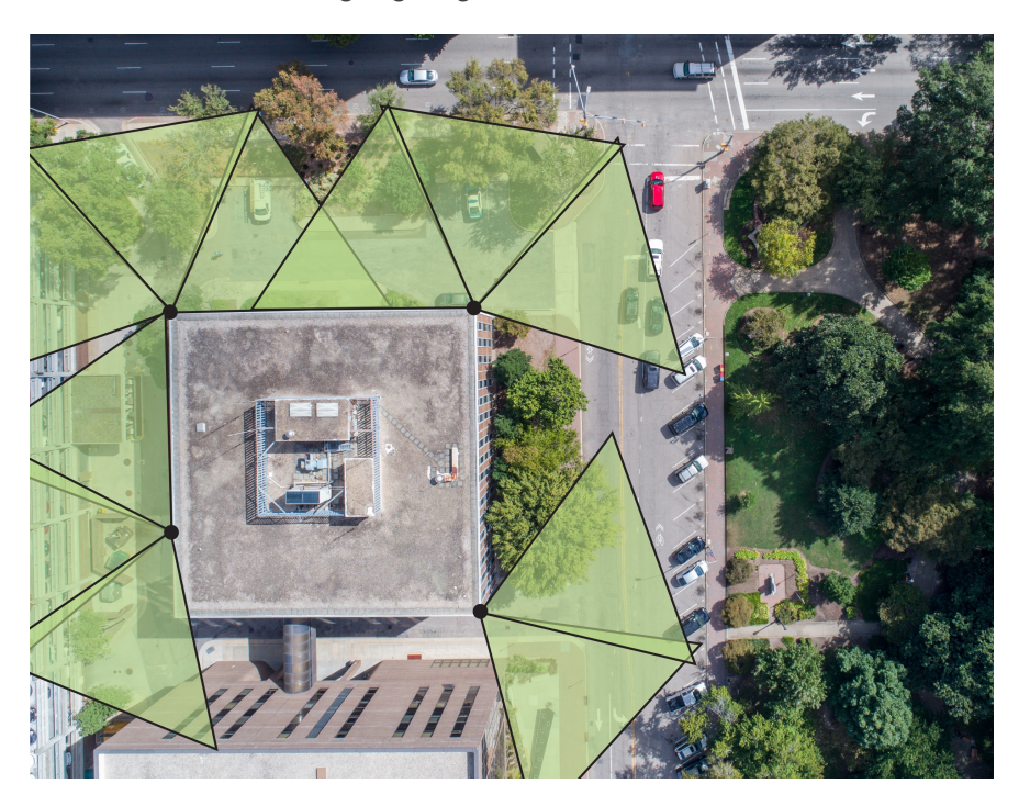
Figure 1: Example of overlapping fields of view for coverage of a building's perimeter.

Be careful not to select a coverage area that is too large, as objects may become obscured by rain or fog even when there is enough lighting and contrast.